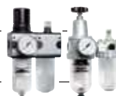
Service units from page 330