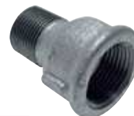
type 246/M4 red