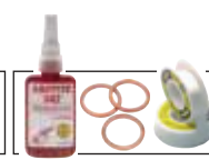
LOCTITE Liquid seals, gaskets & tapes from page 549