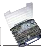
Multibox MSV Brass nickel-plated re- ducing, connecting and closing nozzles from M5 up to 1" on page 596