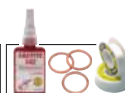
LOCTITE Liquid seals, gaskets & tapes from page 549