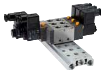
for 5/2-Wege and 5/3-way valves