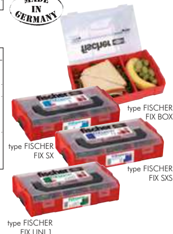
type FISCHER FIX BOX