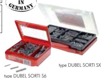
type DUBEL SORTI SX