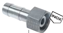
rotatable union nut