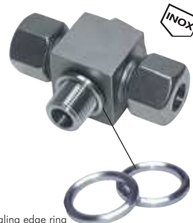
sealing edge ring