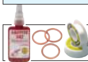
LOCTITE Liquid seals, gaskets & tapes from 549

All data are considered to be unbinding reference values. We accept no liability for data selection that is not confirmed in writing. Pressure data refer, if not otherwise indicated, to liquids of Group II at +20°C.