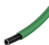
Double-Wall Tube 8mm O.D Outer X 6mm O.D Inner